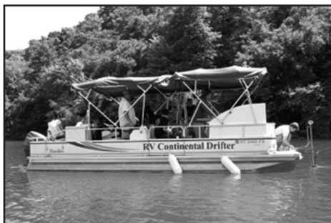
The "Continental Drifter," Hamilton's research vessel.

Bathymetry involves studying and mapping depths of lakes and oceans. The Continental Drifter staff's current agenda entails production of a new, high-resolution, digital bathymetric map of Oneida Lake's bottom, or "bed." This is an ambitious task. The Hamilton research crew has enjoyed two productive summer seasons on the lake, but has only mapped the eastern third of the basin.